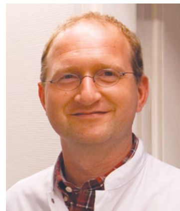
Jean-Paul de Vries St. Antonius Hospital Nieuwegein, The Netherlands